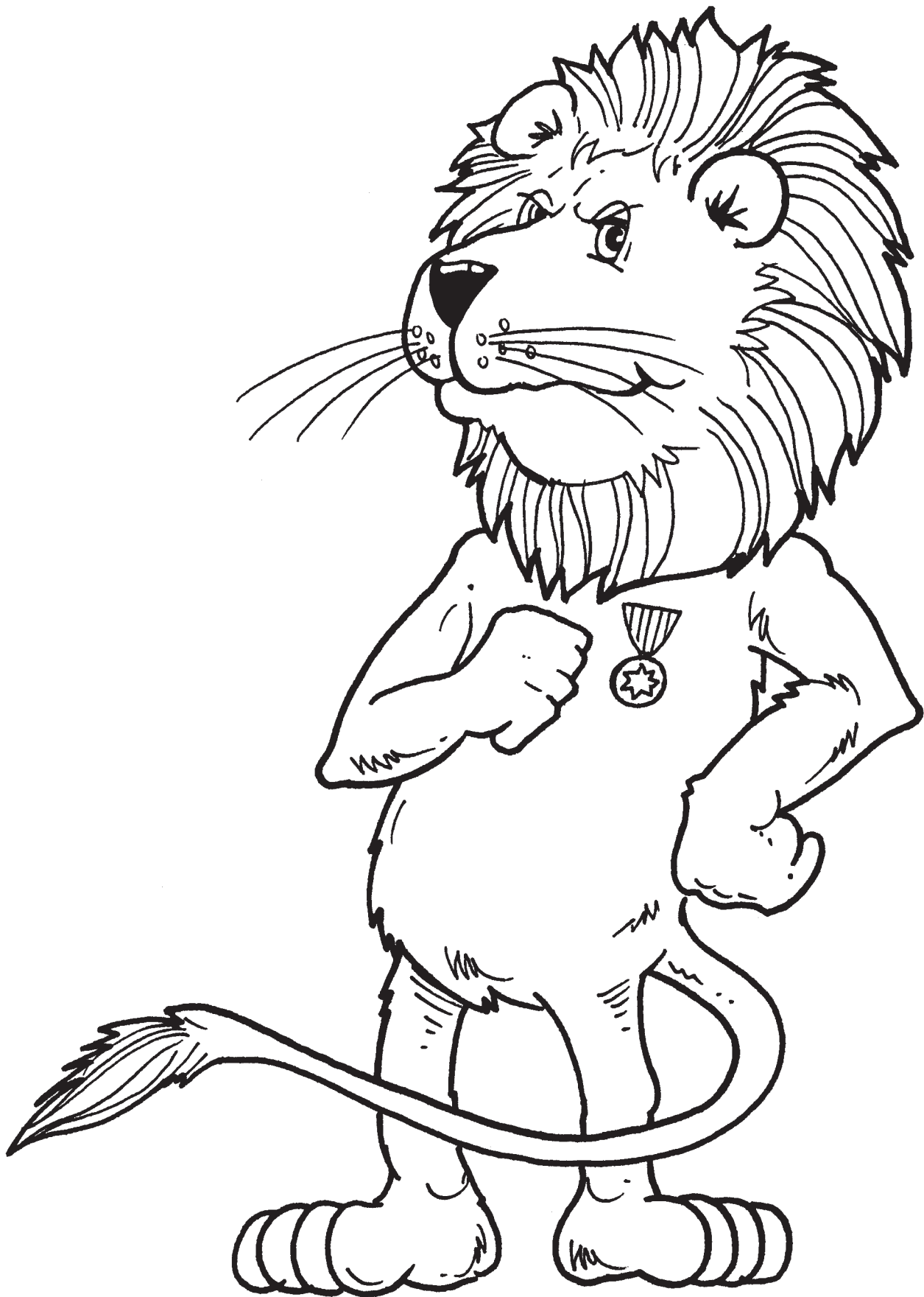
Picture Card #19- brave Copyright © 1995 by Academic Communication Associates.