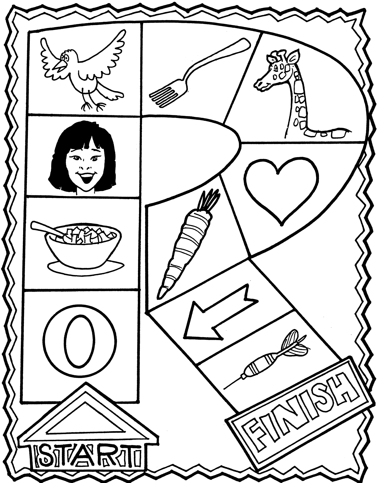
Gameboard 2 - Medial Position Copyright © 1997 by Academic Communication Associates. This page may be reproduced.