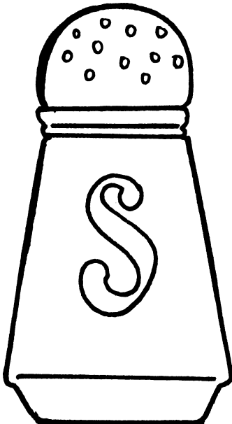
L-19: sal (salt)